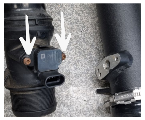
Step 10 Remove 2x T20 screws to remove the sensor.

Remove 2x 7mm hose clamps and slide the hose out from the car. remove 1x vacuum line. Disconnect 1x cable connector and remove the pipe from the car.